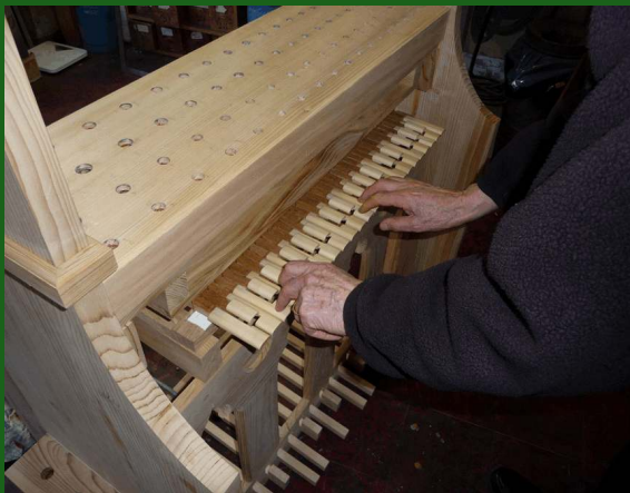
Keys, windchest, upperboard and pedals

Mooi orgel, schitterend! De klank is zo mooi!?