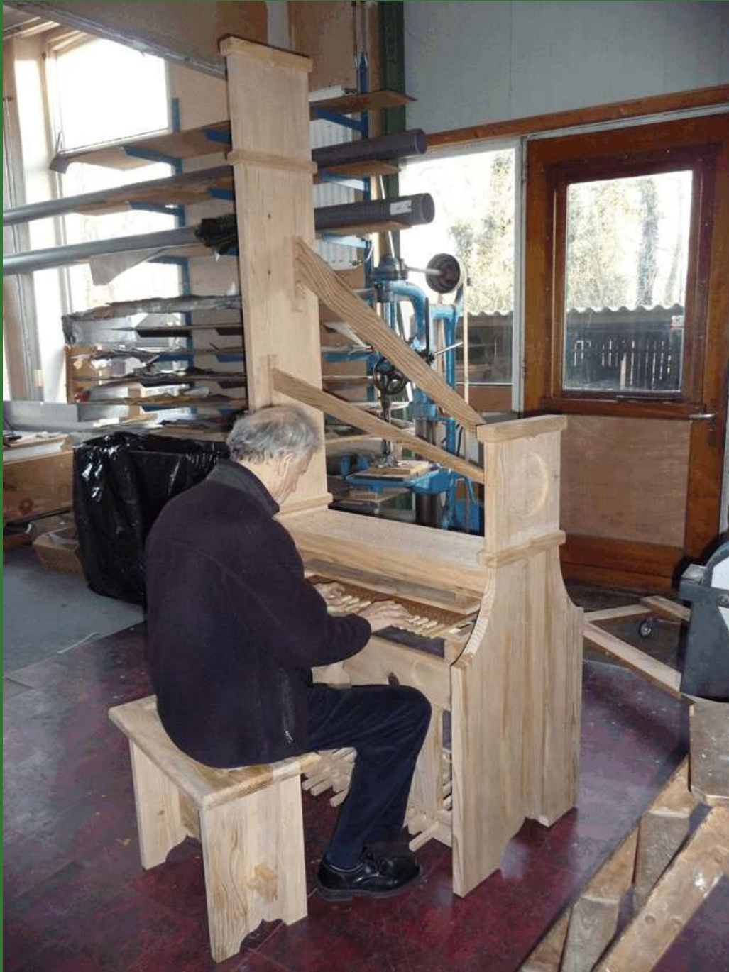
Testing it out for size (it fits!)