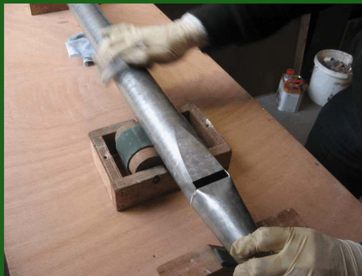
Making the lead pipes