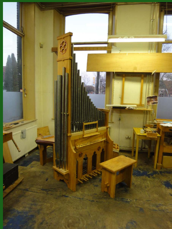
In the workshop at Finsterwolde: with the constant-scaled rank mounted instead of the 6' rank

The constant-scaled rank has its diameter based on the medieval prescription of “the width of a pigeon’s egg”